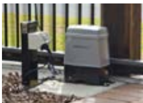
Weather resistant opener