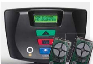
Wall Mounted Logic Controls with Safety Beams and Two TrioCode™ transmitters