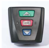
Manual Open/Stop/Close Panel