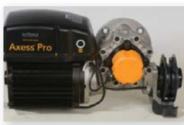
Opener with various install options